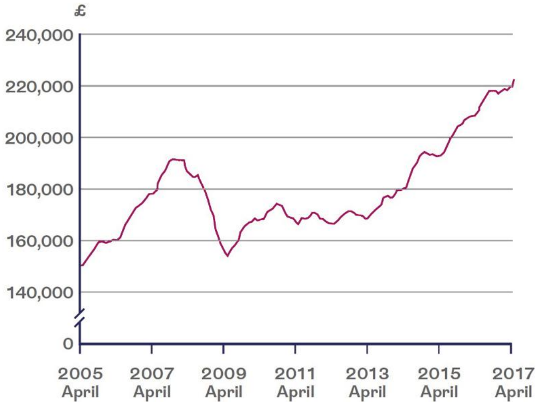
Figure 1. Average UK house price, April 2005 to April 2017