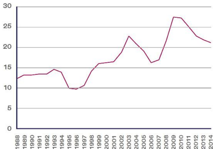
Figure 2. Average deposit as a percentage of purchase price: First Time Buyers 1988 - 2014

Source: House Price Index - February 2016 (Table 38), ONS